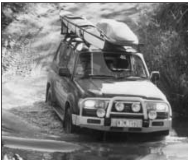
Testing the new vehicle – one of the many river crossings in the Purnululu National Park.

On sealed road at last we visited Fitzroy Crossing and then headed west to Derby, where from the wharf you can see the highest tides in the southern hemisphere.