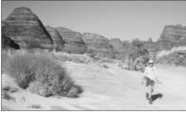
Hiking up Picaninny Creek, Purnululu National Park.

we got a flat tyre. We headed for Jack's Waterhole on the Durack River to repair the tyre. This is a great place for fishermen as there is no danger from saltwater crocodiles.