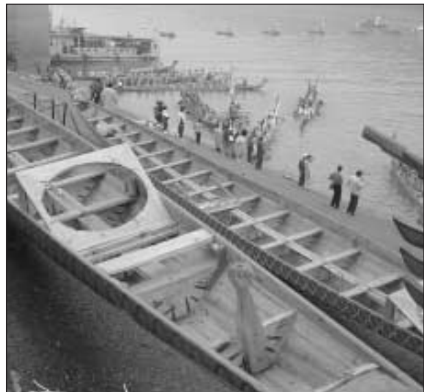
Dragonboats ready to be launched.

The second regatta was held at Jingzhou 200 kilometres downstream from Yichang (May 1–2 2001).