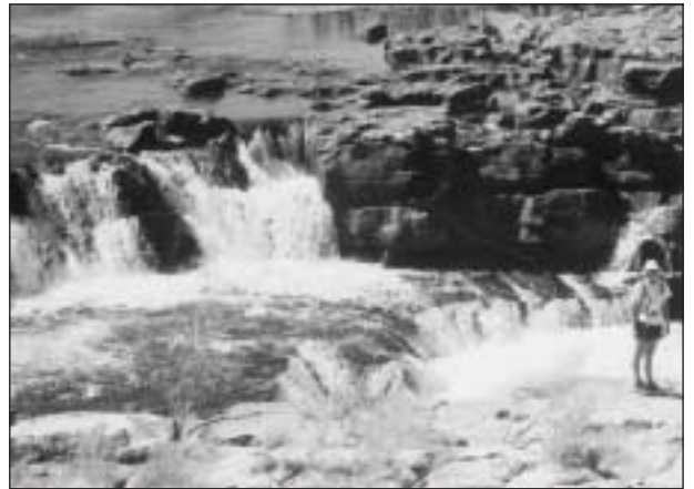
Mitchell Falls on the Mitchell Plateau.

On the west coast of WA we stayed in Exmouth spending a wonderful day snorkelling in the Ningaloo Marine Park. It is the only large reef that occurs so close to the Australian land mass and it is WA's longest coral reef.